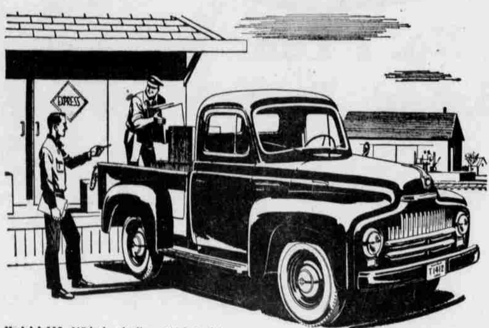
Model L-110, 115-inch wheelbase, 64-foot pickup body, 4,200 lbs. GVW. Pickups in the L-110, L-120 and L-130 Series include 115, 127 and 134-inch wheelbases, 6 1/2, 8 and 9-ft. bodies, GVW's to 8,600 lbs.