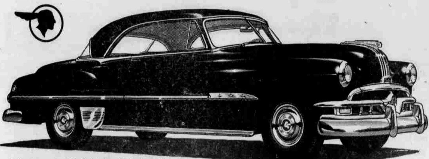
Equipment, accessories and trim illustrated are subject to change without notice.

WE'D like you to come in and hear a wonderful story. First of all, it's the story of a great car—a car whose name is respected and admired everywhere in America. We are sure that the word "Pontiac" means something distinct and different from any other name in the motor car world. The word Pontiac means a good solid citizen—a thoroughly good car—a beautiful car—a