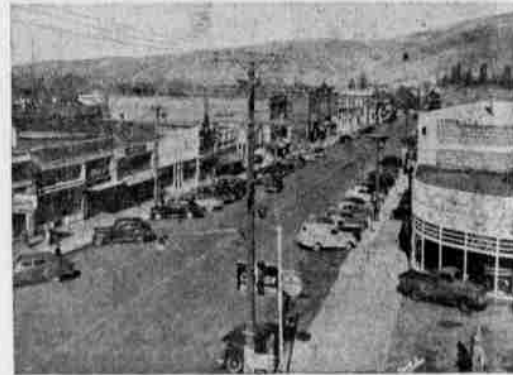
SHOWN ABOVE are just three of the many pictures illustrating the recently published Chamber of Commerce brochure now available for general distribution to the public. Many downtown stores will have them on hand. Top photo shows harvest scene, logging operation in southern Morrow county, lower, main street of Heppner.