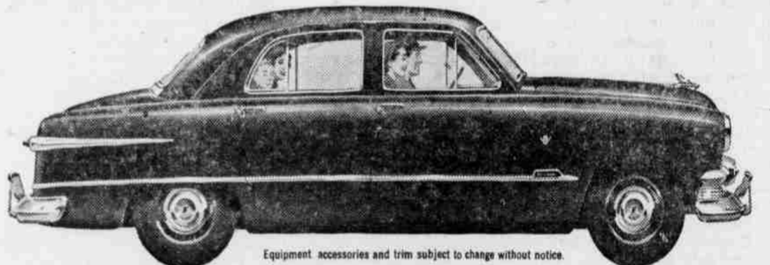
Equipment accessories and trim subject to change without notice.