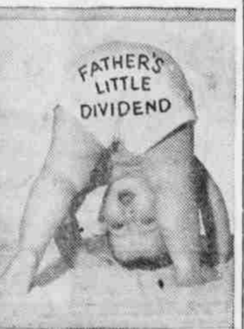
The blessed event of 1951... merrily surpassing "Father of the Bride"... again starring Spencer Tracy, Joan Bennett