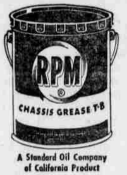
A Standard Oil Company of California Product

shock-absorbing cushion, reduces wear on vital parts. Call us about RPM Chassis Grease T-B in the E Z Fill pail. We'll see that you get it promptly.