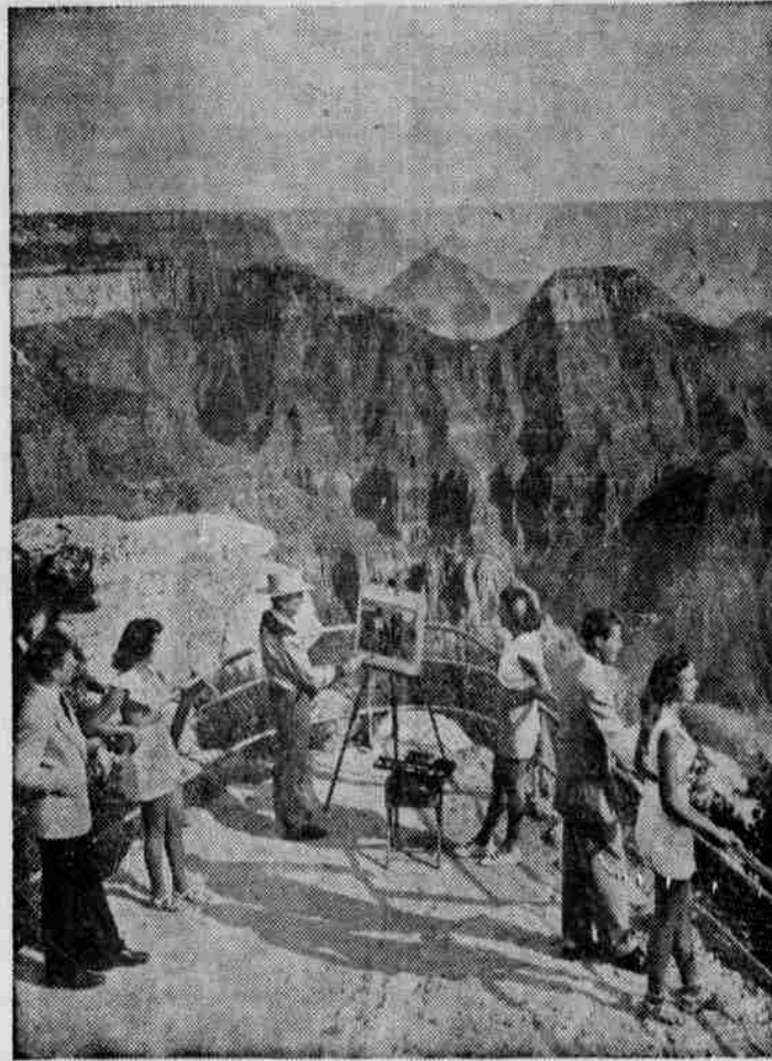
Out of the misty, purple depths of Grand Canyon of the Colorado in Arizona rise varicolored mountains more than a mile high. This panorama from the north rim shows the view summer vacationists receive of the age-old efforts of erosion which is a challenge to an artist's skill. On the very edge of the north rim comfortable accommodations at reasonable cost are provided in cabins and Grand Canyon Lodge.