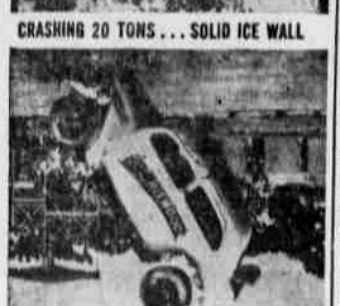
CRASHING OVER, MEN AT WHEEL