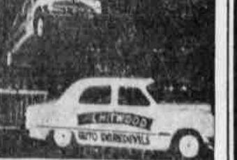
BROADJUMPING NEW 1951 FORDS MORE THAN 100 FEET INTO SPACE AND OVER THREE NEW FORDS RACING UNDERNEATH!