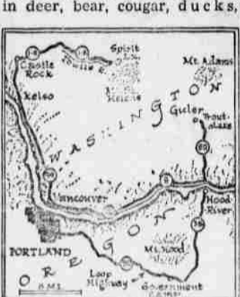
Route of two-day motorlog.

The falls' daytime roar turns to a nighttime lullaby after a zesty day on the lake, or hiking along forest trails.