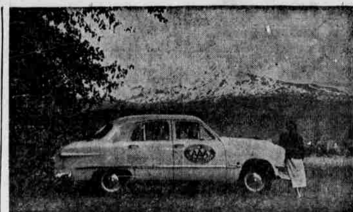
Mt. Adams rules primitive, unspoiled wilderness.

The northward traveler on the Mt. Hood Loop highway takes a last over-the-shoulder look at Mt. Hood and turns his eyes ahead to Mt. Adams. This, in the Indian legend, is the other of the battling braves whom the Great Spirit turned into mountains as punishment for brawling.