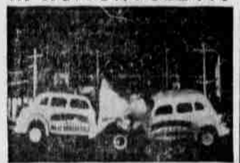
HEAD-ON CRASH AT 60 M.P.H.