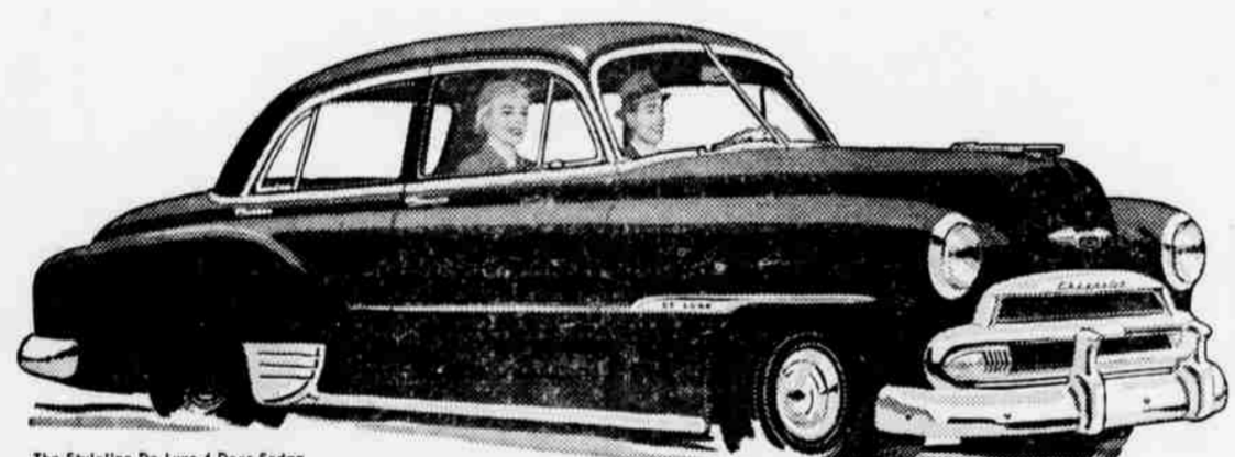
The Styleline De Luxe 4-Door Sedan (Continuation of standard equipment and trim illustrated is dependent upon availability of material.)

WILSON'S MEN'S WEAR The Store of Personal Service