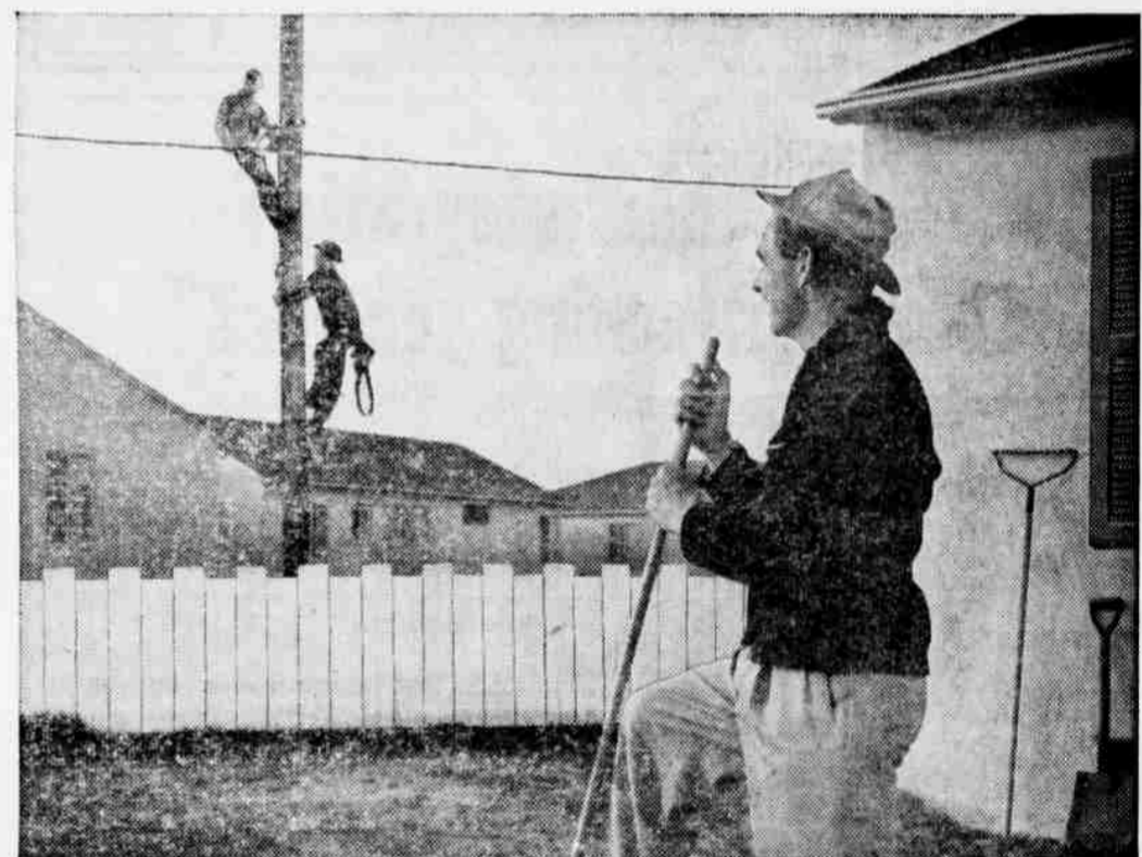
As the West's towns have grown, we've pushed farther out into the "country" with new telephones.