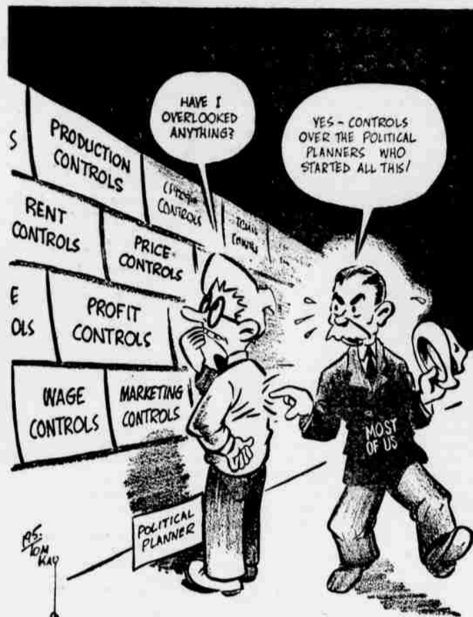
Control The Controllers