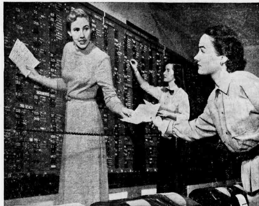
Re-routing Long Distance circuits—one of the many interesting, vital jobs for women in the telephone business.