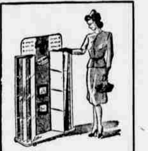
Six beautiful, distinctive western pastel colors to choose from. See this display at our store.

YOU can modernize your own kitchen and bathroom walls with colorful TYLE-BORD pastel panels. The streamlined pattern is a great improvement over imitative "checkerboard" designs... the hard baked plastic enamel surface makes cleaning a pleasure. TYLE-BORD walls 4' high for a 6'x8' bathroom average $72.50—including all the necessary application components. $37.50 of this cost is for the panels themselves. Come in and ask for a free estimate today. Insist on Genuine TYLE-BORD.