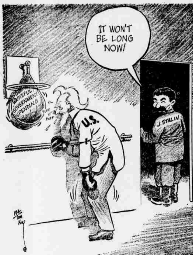
Waiting For The Kill

tinue devices to control production and prices one single day beyond the period required to reconvert industry to normal peace time production.