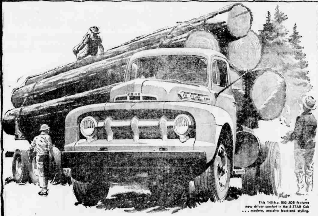
This 145-h.p. BIG JOB features new driver comfort in the 5-STAR Cab... modern, massive front-end styling.