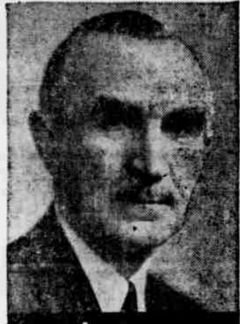
WAYNE MORSE For United States Senator in Congress His recognized ability has made him an outstanding member of Congress