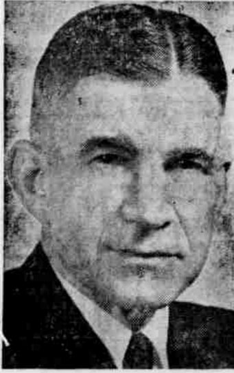
DOUGLAS McKAY For Governor of Oregon He knows Oregon's problems and how to handle them