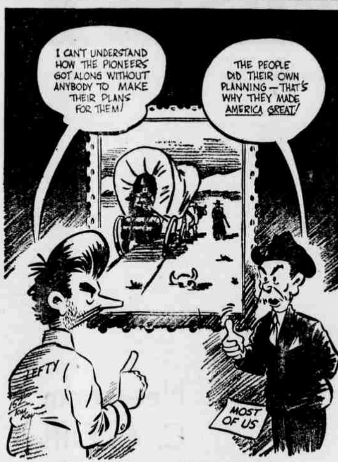
Nothing Strange About It, Lefty

Millikan in Deschutes County; thence south along the posted road to the community of Lake in northern Lake County; thence easterly along posted roads to junction with U. S. Highway 395 at Wagonfire; thence northeasterly along U. S. Highway 20; thence northwesterly along posted county roads to intersection with U. S. Highway 20; thence westerly along U. S. Highway 20 to Pine Mountain road, to point of beginning.