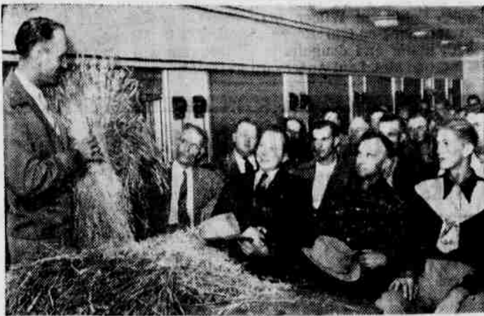
Diseases and insects in cereal crops, as well as in other crops, will be studied on Union Pacific Railroad's unique agricultural improvement car during its tour this year. Subject matter covered at the forums will be governed by the agricultural characteristics of the locale in which the car is visiting.