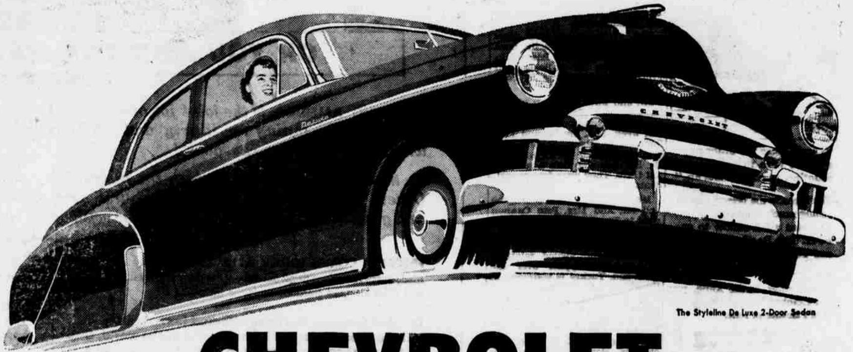
The Styline De Luxe 2-Door Sedan