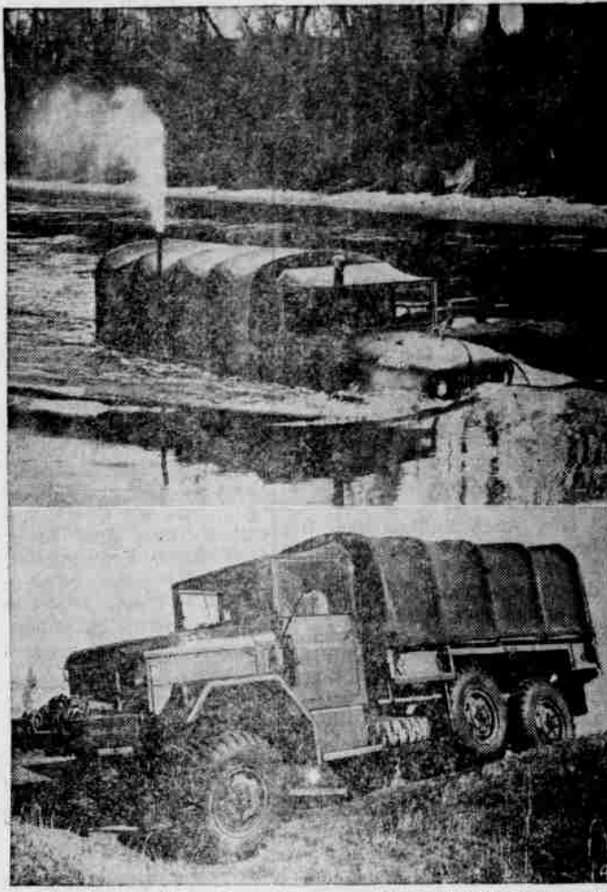
Here's a brand new Army Ordnance vehicle—the "Eager Beaver". The 2 1/2-ton truck, now in full production at Reo Motors' plant in Lansing, Mich., is built for high speed on and off the highway, and is designed to operate normally in sub-zero cold, blistering heat, or with its Gold Comet engine completely submerged in water. Reo has been awarded contracts for approximately 8,900 of them at a cost of about $55,000,000. In the top panel, the "Eager Beaver" is shown "cruising" in Chesapeake Bay, Maryland.