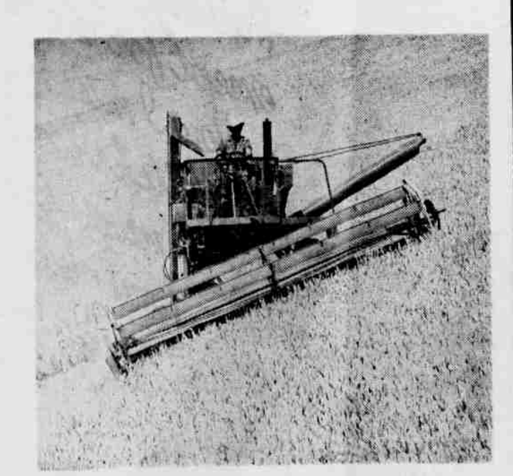
The Model SPH-88 harvesting wheat on steep hillsides of Walla Walla County, Washington

34" ALL-STEEL "BALANGED" CYLINDER 60 BUSHEL CAPACITY BULK GRAIN BIN AIRPLANE CONTROL LEVER HYDRAULIC BRAKES-HEAVY DUTY TILTING WIDE-SPREAD REAR WHEELS MAIN DRIVE WHEELS, WIDE BASE AUGER HEADER-14'6" CUTTING WIDTH