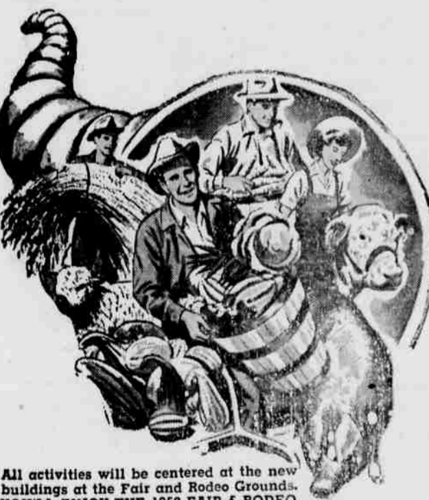
All activities will be centered at the new buildings at the Fair and Rodeo Grounds. YOU'LL ENJOY THE 1950 FAIR & RODEO

There will be the annual 4-H Pig and Calf Scrambles . . . the 4-H Fat Livestock Sale . . . Horse Show, and all of the activities that make for a good county fair.