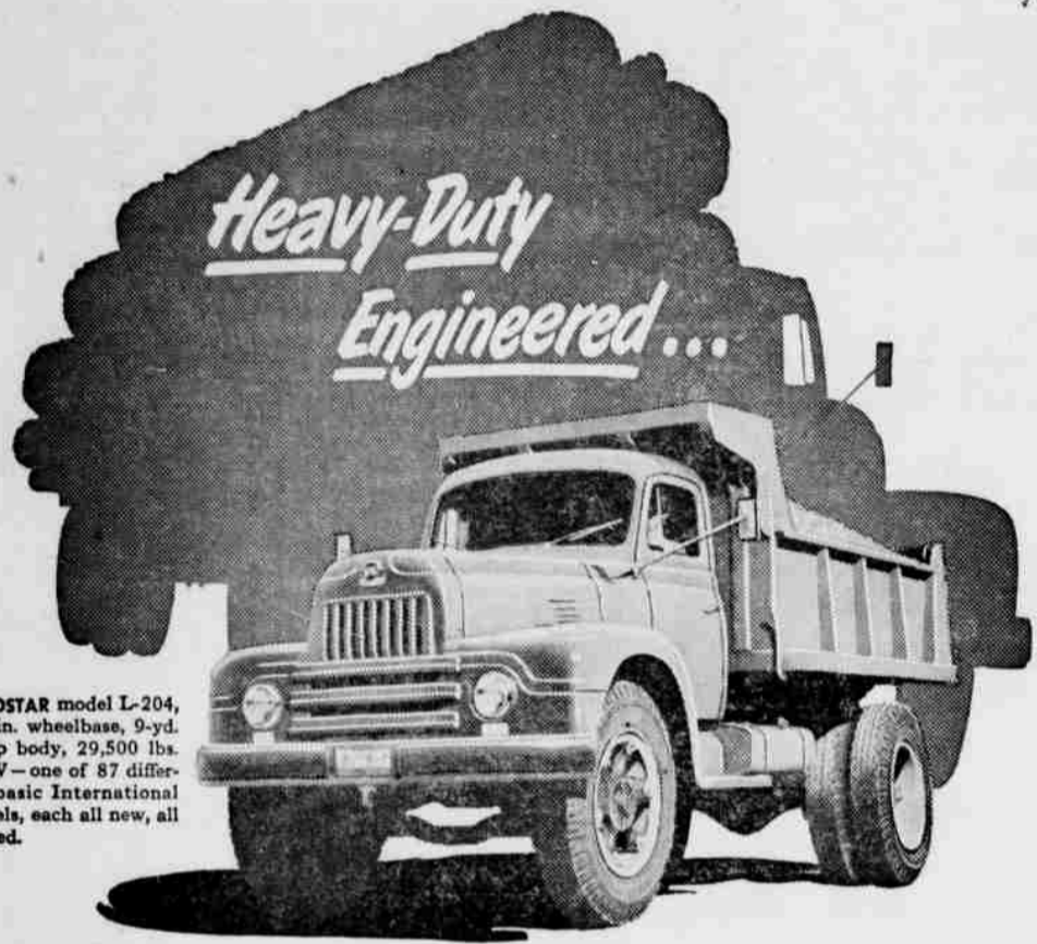
LOADSTAR model L-204, 142-in. wheelbase, 9-yd. dump body, 29,500 lbs. GVW—one of 87 differ- ent basic International models, each all new, all proved.