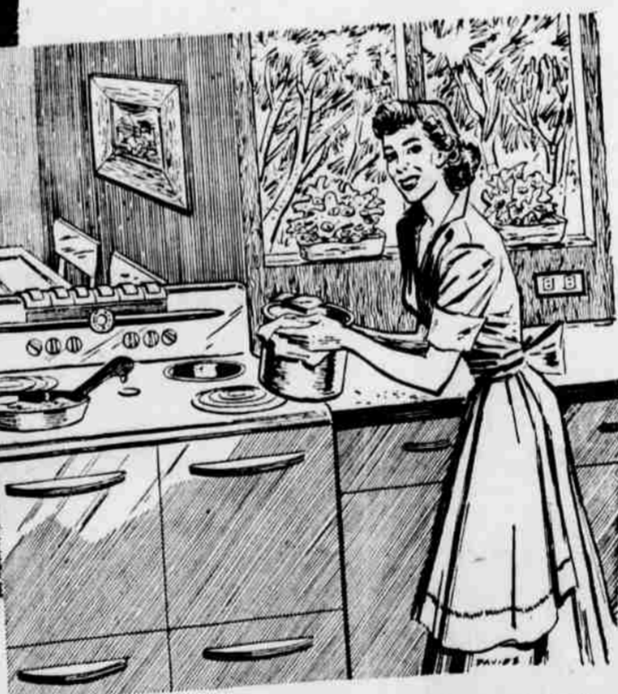
1950 TODAY'S KITCHEN is clean, cool, comfortable, thanks to cheap, convenient electricity. In 40 years since Pacific Power & Light was organized, housekeeping drudgery has practically disappeared. Progress like this is the result of the good American system of business enterprise.