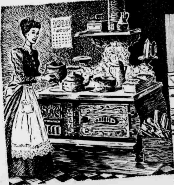
1910 FORTY YEARS AGO most kitchen ranges were fired with wood. They overheated the kitchen and demanded constant attention. Electric ranges were being developed, but the electricity to run them was costly and seldom dependable.