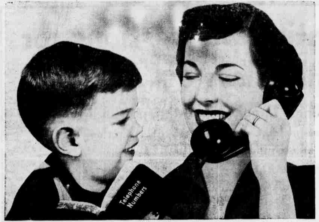
If you keep a list of out-of-town numbers, you'll find calls are put through much faster—often in 30 seconds.