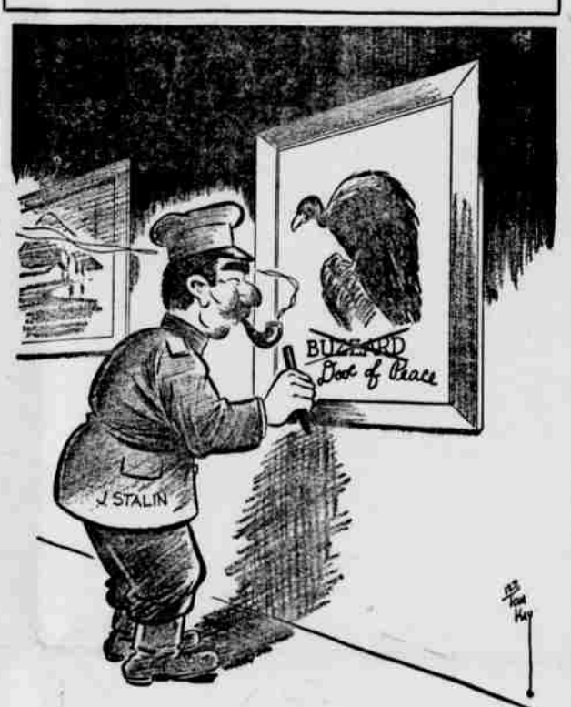
Who does he think he's fooling?