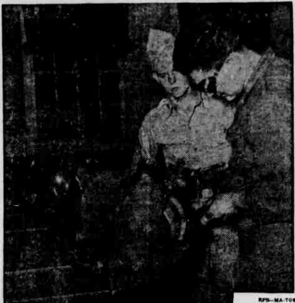
LET THE CHIPS FALL WHERE THEY MAY, but this soldier-mechanic operating a grinding wheel at Fort Monmouth, N. J., won't get any of the flying metal particles in his eyes. He is wearing specially constructed safety goggles which afford ample protection. Always safety conscious, the Army has held its accident rate far below that for comparable trades in private industry.