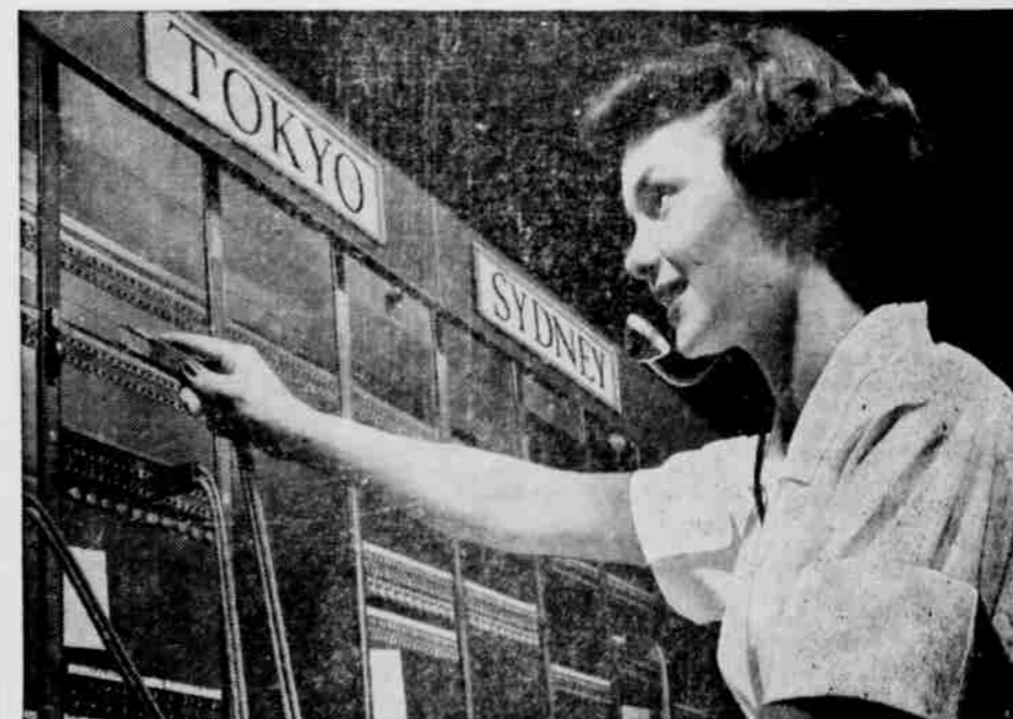
Your voice can reach some 85 countries as easily as a nearby town. The low rates may surprise you.