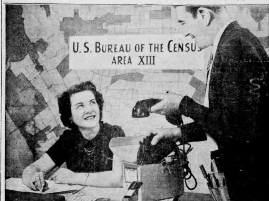
Since the war, Pacific Telephone gained as many telephones in the West as in the previous 19 years.