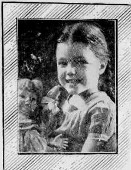
'Aren't You Glad You Had This Taken Last Year?'