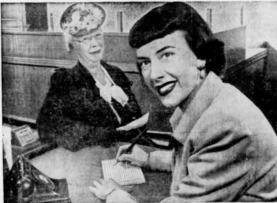
This is the girl to call or see when you want a telephone moved, a directory listing—have any service questions.

ENTER FORD'S $100,000 CAR-SAFETY CONTEST * SEE US FOR ENTRY BLANK