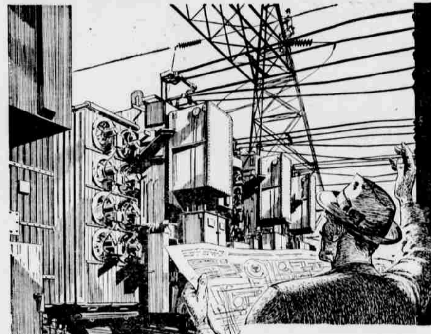
NEW SUBSTATIONS are being built all over the Pacific Power & Light system. They are needed to care for tremendous population growth in Oregon and Washington. Average cost of each installation like this is approximately $200,000.