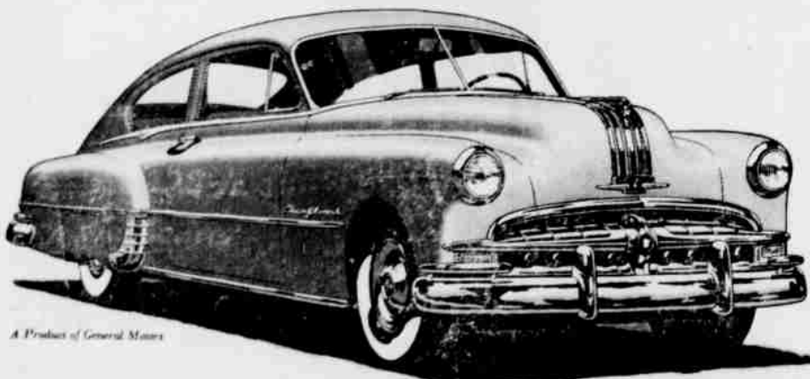
A Product of General Motors