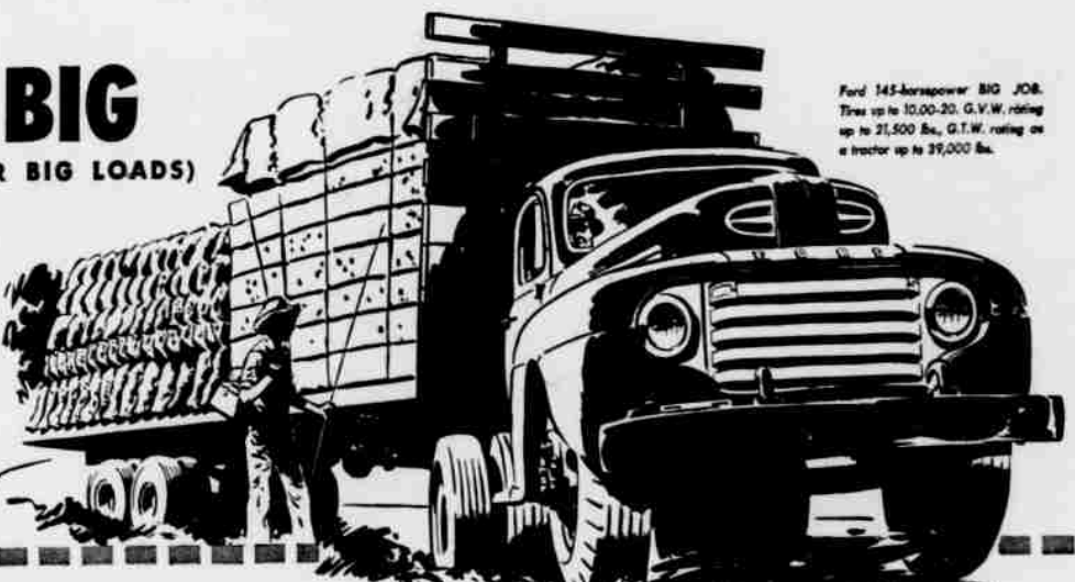
Ford 145-horsepower BIG JOB. Tons up to 10,000-20. G.V.W. rating up to 21,500 lbs. G.T.W. rating on a tractor up to 26,000 lbs.