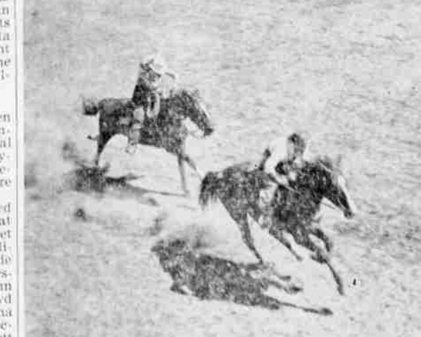
This action picture illustrates the earnestness with which the participants enter into the rodeo performance. The women and girls are no less enthusiastic than the men and boys and contribute much to the success of Wrangler events. Their skill frequently puts some of the better men performers to the test and powder puff and rouge are forgotten when there is an event to be run off.