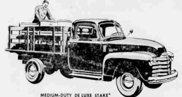
MEDIUM-DUTY DE LUXE STAKE® Model 3609—125 1/4-inch wheelbase, Maximum G.V.W. 5,800 lb. Other models available up to 161-inch wheelbase and 16,000 lb. G.V.W.