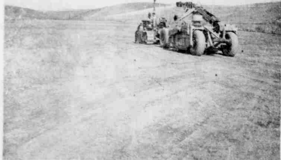
This is a picture of the Crum Bros. land leveling equipment at work in the Vernon Brown field midway between Lexington and Ione. The field com-

prises approximately 13 acres. 4500 yards of dirt were moved at the rate of over 115 yards per hour. Photographer Louis Lyons snapped the picture as