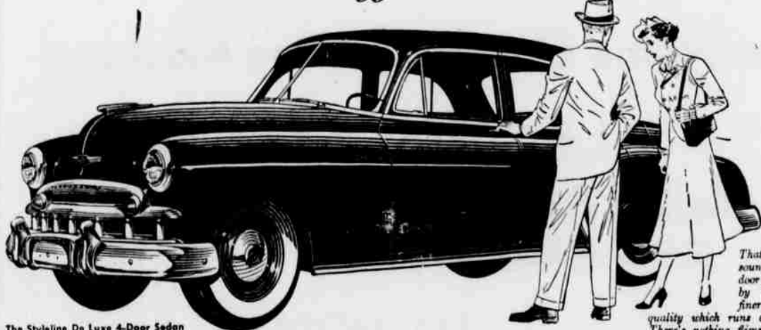
The Stylized De Luxe 4-Door Sedan White sidewall tires optional at extra cost.

See the difference... Hear the difference!