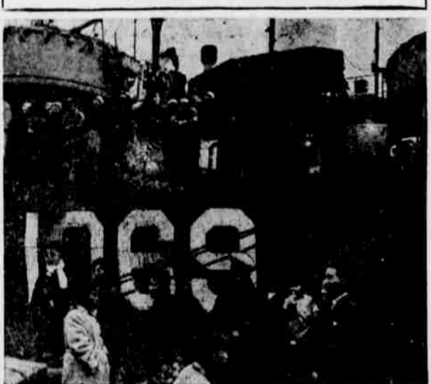
In the post-war repatriation of exiled Korean civilians and Japanese troops to their homelands, U. S. Navy LST's made seven trips to accomplish that mission of mercy. Photo shows crew members of USS LST 1089 watching Korean civilians as they prepare to board the vessel prior to the last trip.