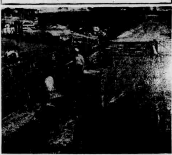
On farms established by the U. S. Naval Government on Guam, American sailors instruct natives in modern agricultural methods. The produce from the farms is used for Naval personnel and the rehabilitation of the natives. In photo above, a seaman, first class drives some pigs to feed.