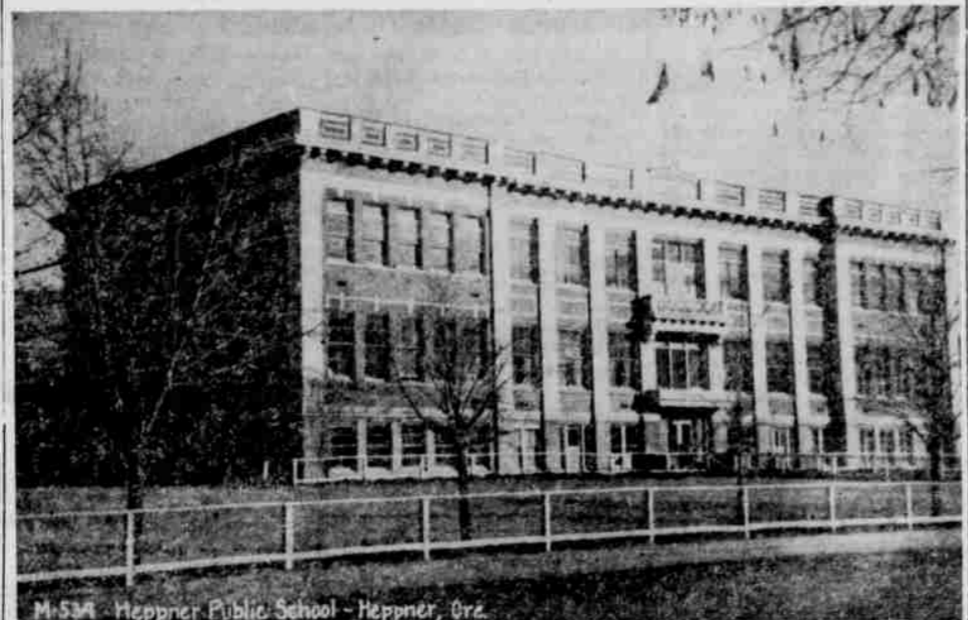
Heppner's central school building, which houses both grades and high school. There are three other buildings on the school campus—the gymnasium, auditorium, the heating plant and the agriculture building.

Commencing at a point 100 feet North of the S.E. corner of Lot 8 in Block 1, Ayers' Fourth Addition to the City of Heppner, thence West on a