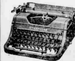
Humphreys Drug Co. Hepner, Oregon

A self-contained renewal application and other improvements have been incorporated in Oregon's license cards now being issued. Secretary of State Earl T. Newby has announced. Licenses to be used from now on are of better paper stock than was available during the war and are expected to stand up well in wallets and purses, eliminating much of the duplicate license problem. Newby emphasized that the new cards will not replace valid licenses now outstanding.