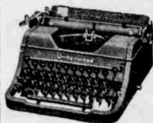
Humphreys Drug Co. Heppner, Oregon