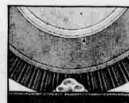
"AIR CUSHION" TIRE. See how it ENVELOPS irregularities . . . smothers "shock" BEFORE it can reach you!