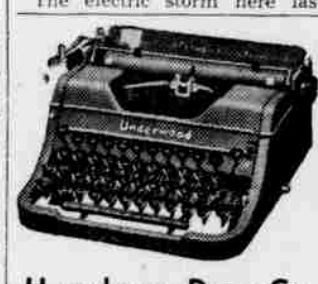
Humphreys Drug Co. Heppner, Oregon