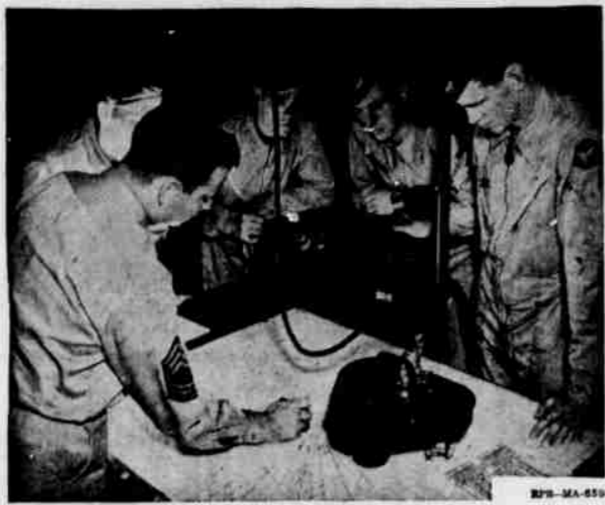
An instructor explains the intricate details of instrument flying to Aviation Cadets in a Link trainer class. This new Cadet Training Program is open now to mentally and physically qualified single men between 20 and 26 1/2 years of age.

Lots 20 to 22, in Block 15 of Irrigon, Oregon for the minimum price of $50.00, cash; Lots 21 to 23 inc. and Lots 24 to 26 inc. in Block 27 of Irrigon, Oregon for the minimum price of $50.00, cash.