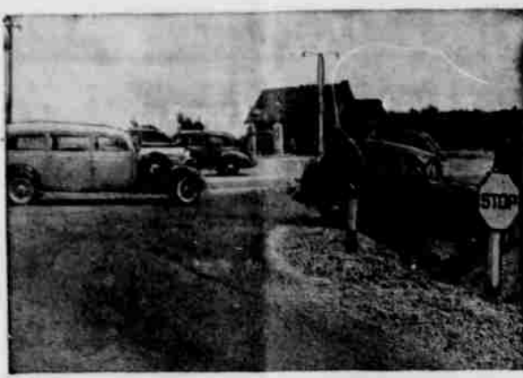
Driver of the car in the ditch failed to yield the right-of-way, even to an ambulance. He ran through a plainly visible stop sign, directly into the path of the ambulance, and was knocked across the road. Driver was killed, and a passenger was injured. Emergency vehicles always have the right-of-way—but at other times, too, it pays to be courteous at intersections. Failure to grant right-of-way ranked second as a cause of motor vehicle deaths in 1946. National Conservation Bureau advises: when in doubt, always yield the right-of-way.

Supervisors of the newly organized Boardman Soil Conservation district are now busy planning their program of work to be undertaken through farmer-cooperation in the district. At the regular meeting held last Thursday evening, October 16, the district supervisors set up their district problems, formulating then, a program of long-time objectives to be carried out in solving these problems. Among the long-time objectives of the district are establishment of a drainage system in the Boardman project, land leveling program to save labor, water, seed and improve crops, weed control program on ditches and