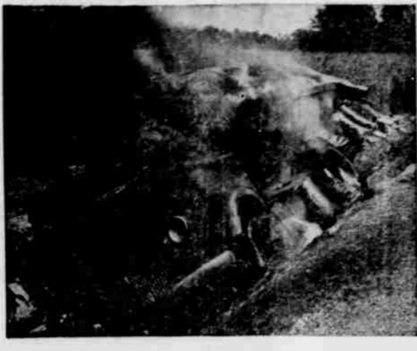
A careless pedestrian was to blame for the wrecking of this truck and the death of its driver. As the pedestrian suddenly crossed the road, directly in front of the truck, the driver swerved off the roadway and his machine overturned in the ditch where it immediately caught fire. Driver was pinned in the front seat and burned to death before he could be extricated.