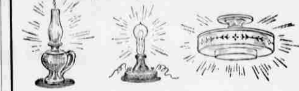
WHEN THE KEROSENE LAMP WAS REPLACED BY THE ELECTRIC LIGHT—