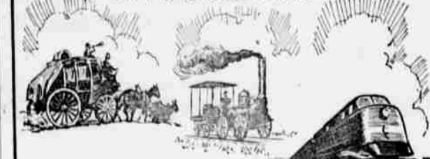
WHEN THE STAGECOACH GAVE WAY TO THE RAILROAD TRAIN—