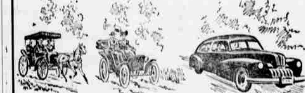
WHEN THE HORSE AND CARRIAGE WAS SUCCEEDED BY THE AUTOMOBILE—

IT MEANT INCREASED PRODUCTIVE CAPACITY FOR THE NATION—MORE JOBS AND MORE PRODUCTIVE JOBS FOR THE PEOPLE. AND THE BENEFITS HAVE ACCRUED TO ALL OF US IN THE FULLER MEASURE OF LIVING THAT HAS COME TO DISTINGUISH OUR DYNAMIC DEMOCRACY.