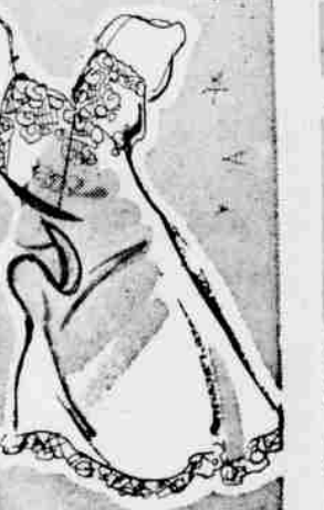
RAYON GIFT SLIPS. Pretty crepes and satins. Tailored and lace trimmed styles. 32-44.

TEEN-AGE 100 percent wool 4.98 They're the rage in the teen age crowd.