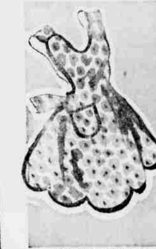
PRETTY APRONS Pert prints and novelty checks. Ruffle, bias and rickrack trim. 49c & 98c