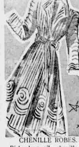
Rich, deep pile chenille in gay, cheery colors. Misses', 12-20; women's 8.65