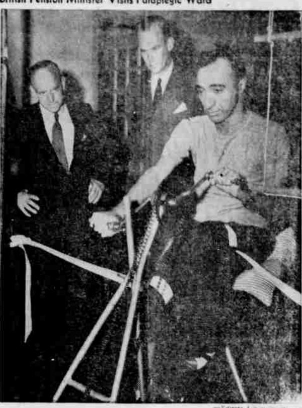
Villred Paling (left), Minister of Pensions for Great Britain, watches a para-