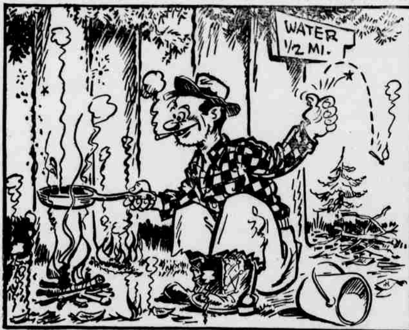
An enemy more dreaded than a Jap balloon. A safe and sane "Fourth" means observing the rules of common sense. In other words, be a fire warden: put out smokes, matches, campfires. KEEP OREGON GREEN

Keep Oregon Green Association—Salem, Oregon