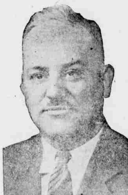
Business Man Publisher Veteran

Your local representative for STANDARD OF CALIFORNIA