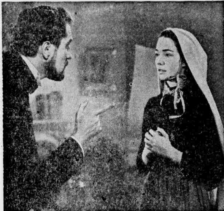
Despite the desperate threats of Prosecutor Dutour, played by Vincent Price, Bernadette—Jennifer Jones—remains unshaken in her flaming faith and courage. The filmization of Franz Werfel's "The Song of Bernadette" comes to the Star Theater in Heppner Sept. 13 and 14 as a special roadshow attraction.