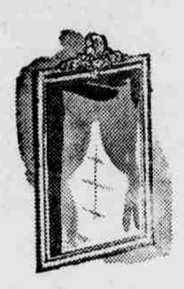
PLATE GLASS Mirror