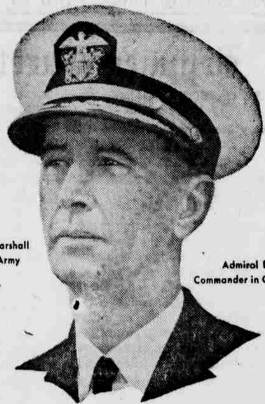
Admiral E. J. King Commander in Chief, U.S. Fleet