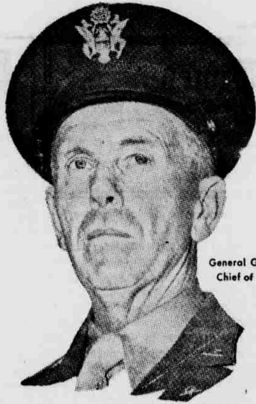
General George C. Marshall Chief of Staff, U.S. Army